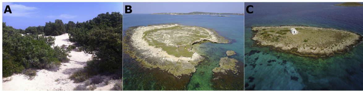
Fig. 2. The three sampling habitats: (A) Alyko on Naxos Island, (B) Galiatsos islet, (C) Kampana islet.